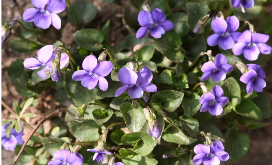
Heath Dog-violet, Viola canina