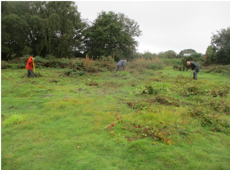
Volunteers clearing brambles

Lastly, a word about this website. Some changes will be taking place for technical reasons in the near future and it will have a completely different look, although the website name www.preesheathcommonreserve.co.uk will remain the same. Nevertheless I hope it will continue to provide everyone who uses it with as much information about the reserve as they need.